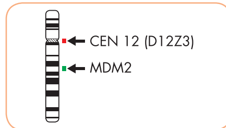
Ideogram of chromosome 12 indicating the hybridization locations.