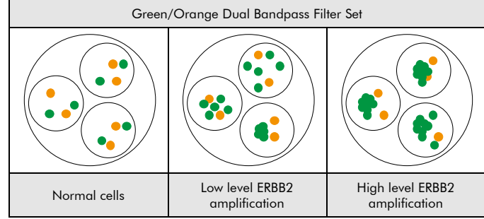
Fig. 2: Expected results in normal and aberrant nuclei

Overlapping signals may appear as yellow signals.