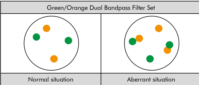
Fig. 2: Expected results in normal and aberrant nuclei

Overlapping signals may appear as yellow signals.