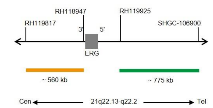
Fig. 1: SPEC ERG Probe map (not to scale)

The ZytoLight SPEC ERG Dual Color Break Apart Probe is available in one size: