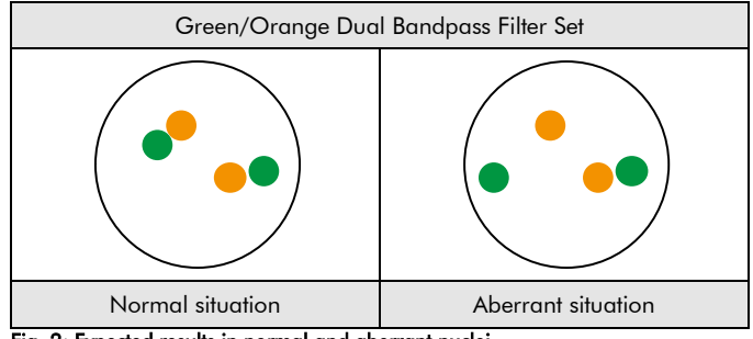
Fig. 2: Expected results in normal and aberrant nuclei

Overlapping signals may appear as yellow signals.