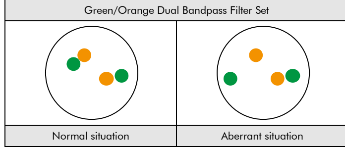
Fig. 2: Expected results in normal and aberrant nuclei

Overlapping signals may appear as yellow signals.