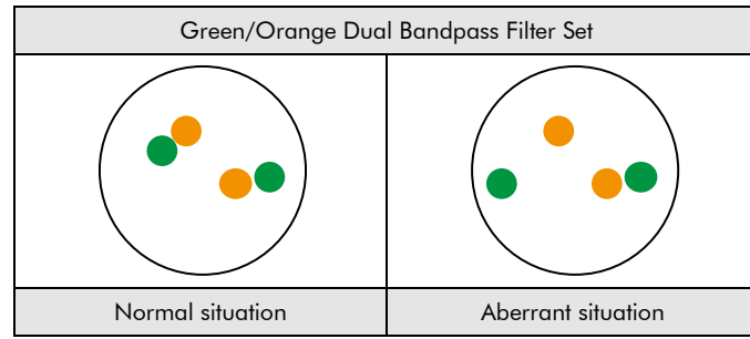
Fig. 2: Expected results in normal and aberrant nuclei

Overlapping signals may appear as yellow signals.