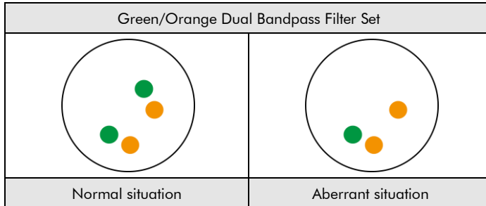
Fig. 2: Expected results in normal and aberrant nuclei

Overlapping signals may appear as yellow signals.