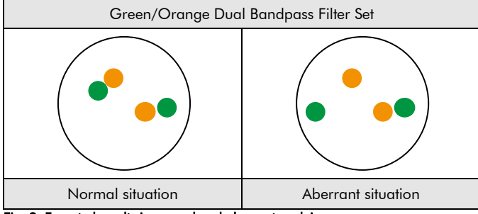
Fig. 2: Expected results in normal and aberrant nuclei

Overlapping signals may appear as yellow signals.