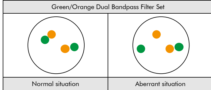
Fig. 2: Expected results in normal and aberrant nuclei

Overlapping signals may appear as yellow signals.