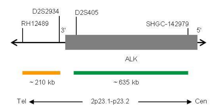
Fig. 1: ALK Probe map (not to scale)

*according to Human Genome Assembly GRCh37/hg19